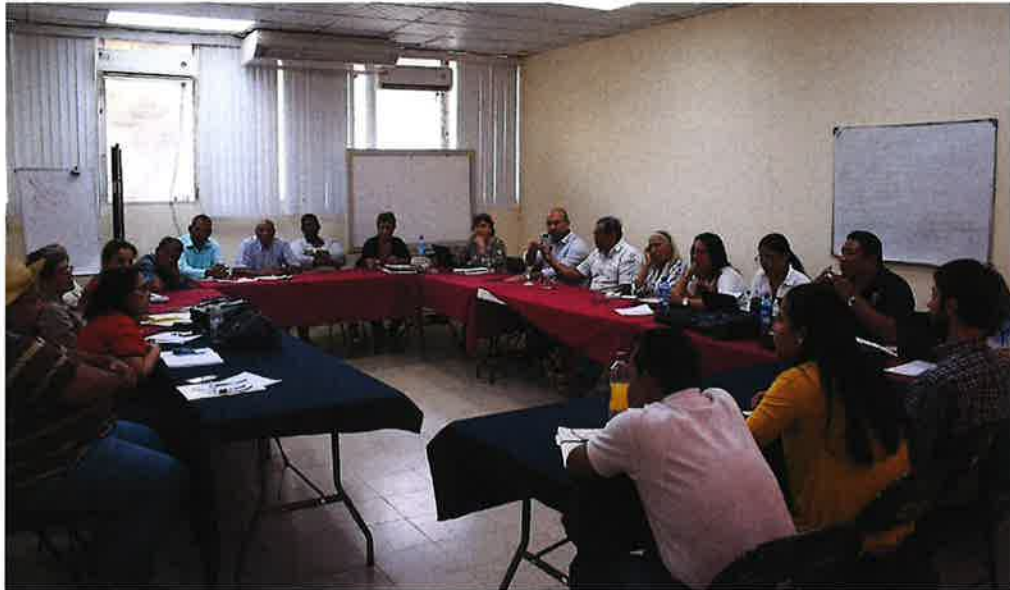
Meeting with representatives of the key stakeholders to establish a roadmap for their participation in REDD during 2018. 13 March 2018.