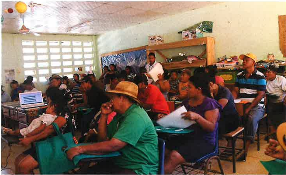
REDD+ Presentation, agroforestry systems, climate change and gender. Awareness-raising in the indigenous community in the province of Bocas del Toro, El Junquito. 26 November, 2018.