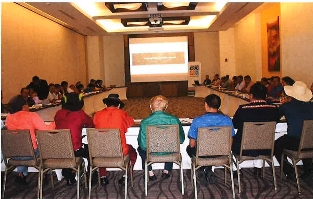
Meeting with indigenous authorities wherein the incorporation of the 12 priorities into the National REDD+ Strategy document was presented. 15 May 2018