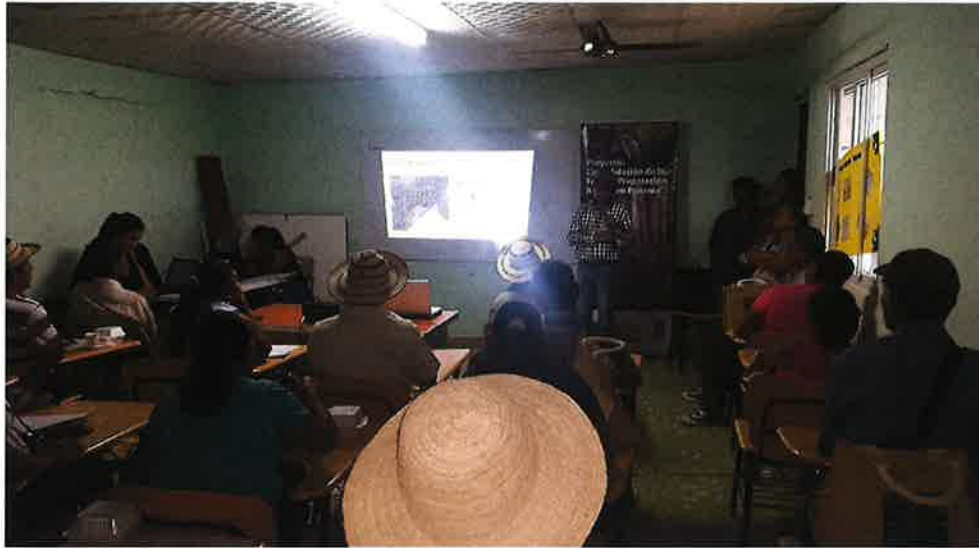
Awareness-raising workshop on REDD+, gender, climate change and silvopastoral systems in the community of Costa Abajo in Colón, members of the local farming community of the Río Indio watershed, 6 March 2018